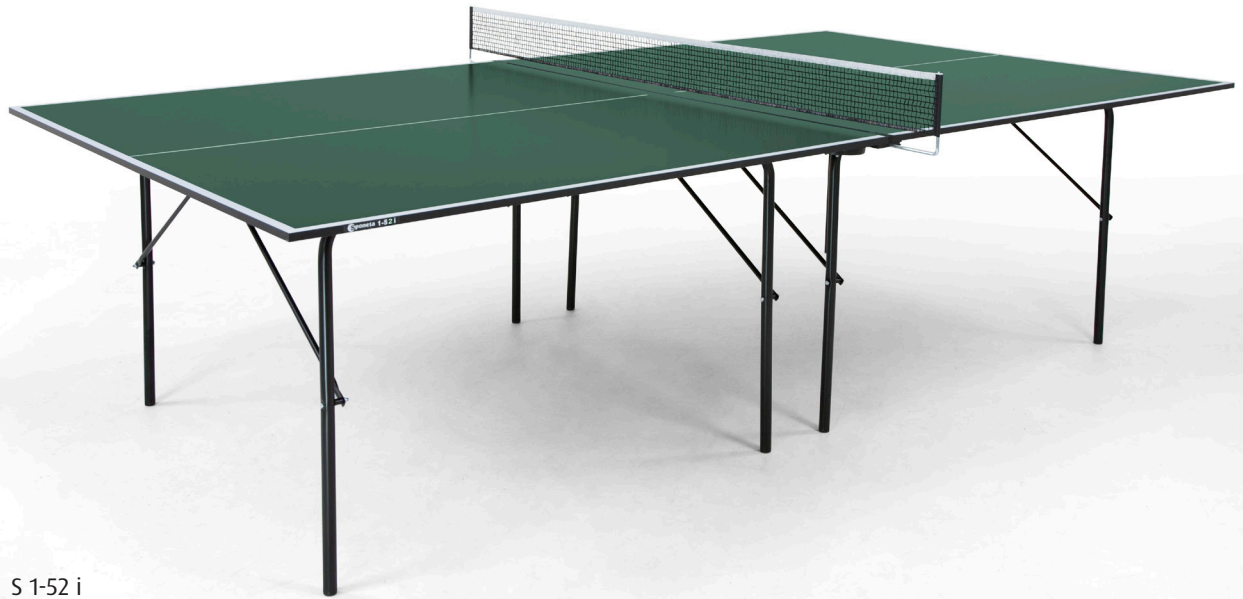
S 1-52 i