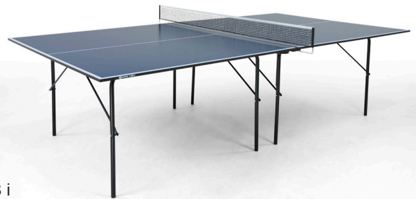
S 1-53 i