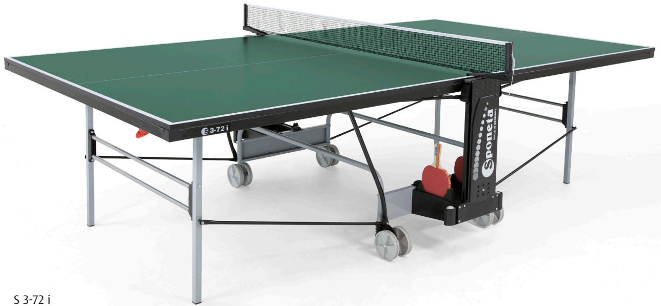
S 3-72 i