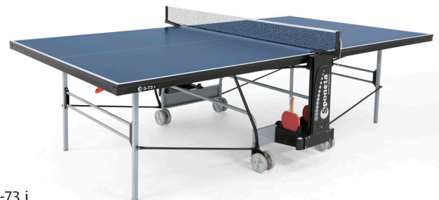
S 3-73 i